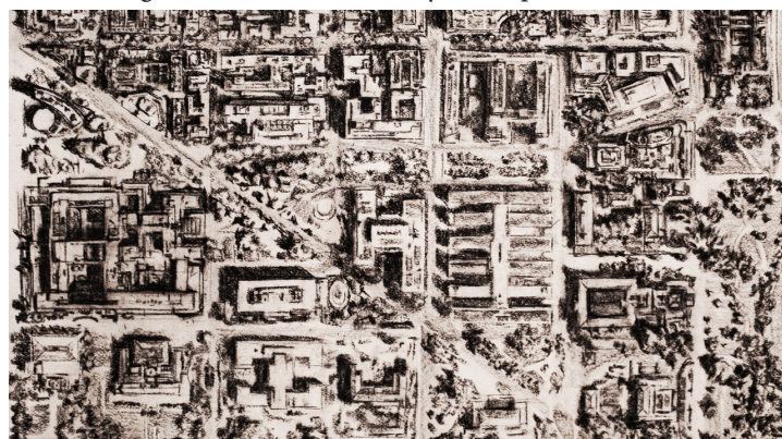
Selina Lee (B. 1998, Texas), Flat Views , 2025, Charcoal on paper

Of the People , the current exhibition in the Stedman Gallery features a selection of works on paper by contemporary artists from across the United States who responded to the question: what does American democracy mean to you? Through investigative research, consulting various formal and informal repositories of knowledge, and reflecting inwardly, this group of artists particularly consider the meaning of American democracy in the present moment.