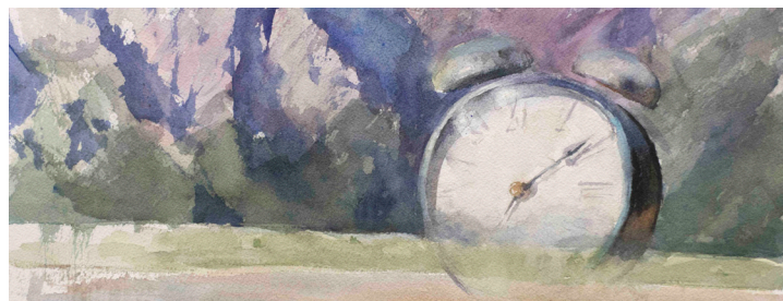
The Documentary , 2025, gouache on paper, Reynier Llanes ( Pinar del Río , 1985)

Paintings by the distinguished artist Reynier Llanes, whom Oxford America recognized as one of "the new superstars of southern art," will be exhibited at the Stedman Gallery, located off the lobby of the Gordon Theater, starting September 18. The exhibition, titled Pursuit of Grace , features existing work as well as new paintings created for this show.