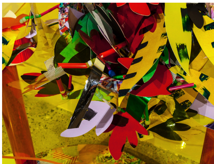
Artwork by Amy Boone-McCreesh

All lectures are free and open to the public, and will be held from 12:45 pm to 1:45 pm (free period) in the Fine Arts Building, Room 110.